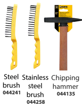
Steel brush 044241