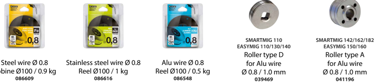
Steel wire Ø 0.8 Bobine Ø100 / 0.9 kg 086609

Depending on the material to be welded (steel, stainless steel or aluminium) certain accessories and consumables must be changed: rollers, liners, contact tubes and protective gas.