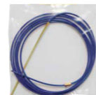
Liner PTFE 3 m For Alu wire Ø 0.6 / 0.8 041578