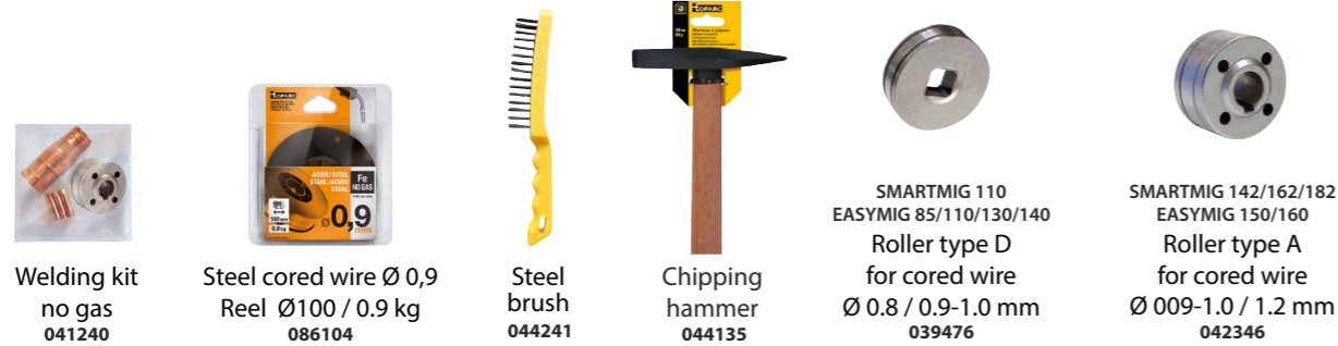
Welding kit no gas 041240