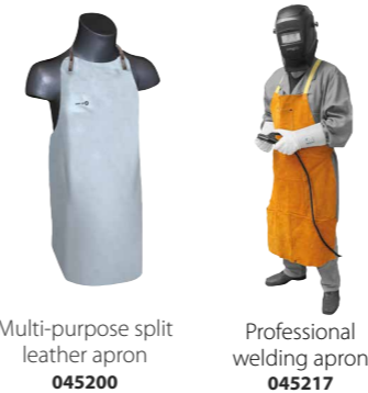
Multi-purpose split leather apron 045200