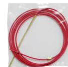
Liner PTFE 3 m For Alu wire Ø 1.0 / 1.2 041585