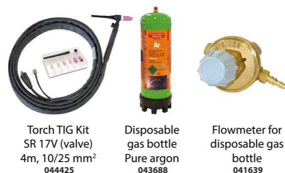
Torch TIG Kit SR 17V (valve) 4m, 10/25 mm 2 044425