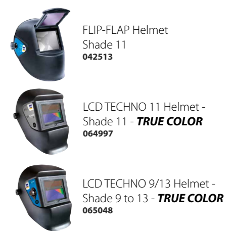
FLIP-FLAP Helmet Shade 11 042513