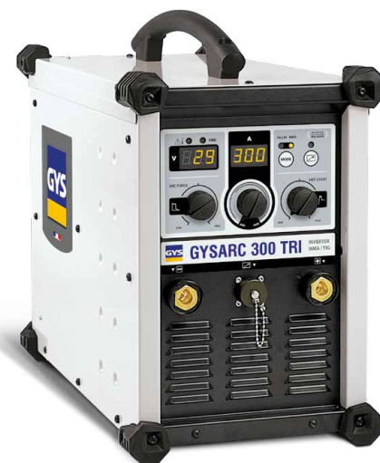
Supplied without accessories