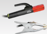
MMA kit 300 A - 4 m - 35 mm 2 038295